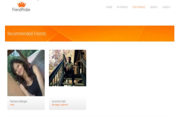
Fig .4. Recommended friends basic on our interest. Copyright to IJARCCE

The next screenshot demonstrates the friend recommended to me based on my major interest i.e. Music from the set of users in my database.