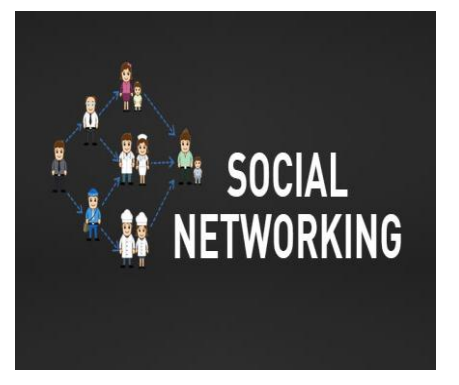
Fig. 1. Social networking

Social networking is expanding the number of social contacts by making connections through individuals. While social networking has gone on almost as long as societies themselves have existed, the unparalleled potential of the internet to promote such connections is only now being fully recognized and exploited, through Web-based groups established for that purpose. it establishes interconnected Internet communities that help people make contacts that would be good for them to know. Websites dedicated to social networking include Linkedin, Facebook etc.